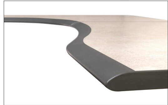
• MT6F Comfort Profile PURTech® Edge