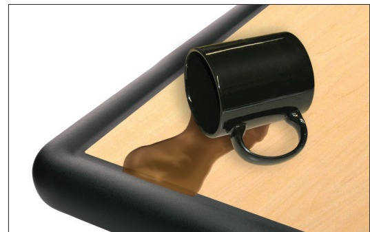
• MA2 No-Drip Profile PURTech® Edge